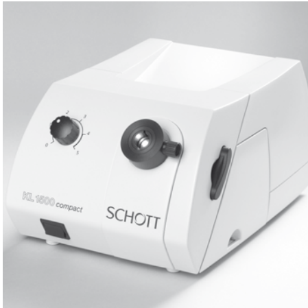
KL 1500 compact