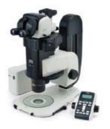
The Nikon SMZ25 is an ideal microscope for microinjection applications.